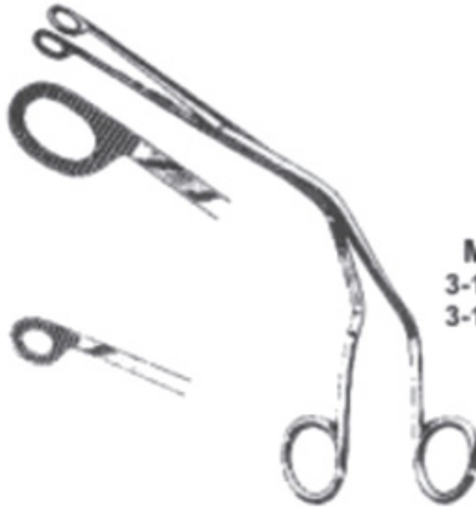
MAGILL 3-140 24cm 3-142 20cm