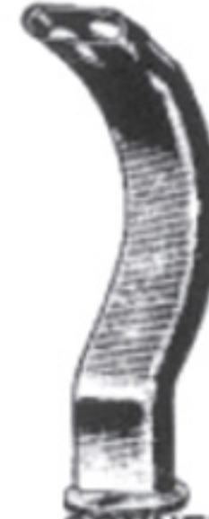
CONNELL 3-130 ADULT 3-132 CHILD