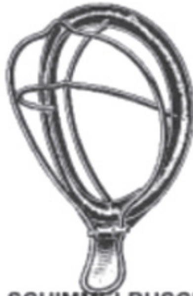
SCHIMMELBUSCH 3-100 ADULT 3-102 CHILD