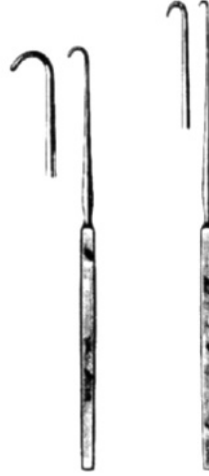
GRAHAM 35-130 16.5cm SACHS 35-140 16.5cm