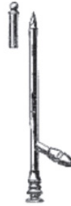
OCHSNER 5-220 10Fg. 5-221 12Fg. 5-222 14Fg. 5-223 16Fg. 5-224 18Fg. 5-225 20Fg.