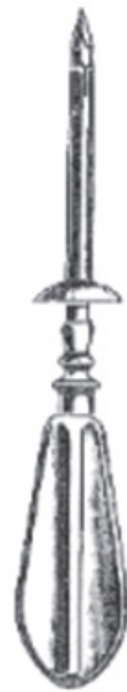
ACITES 5-190 16 Fg. 5-192 21 Fg.