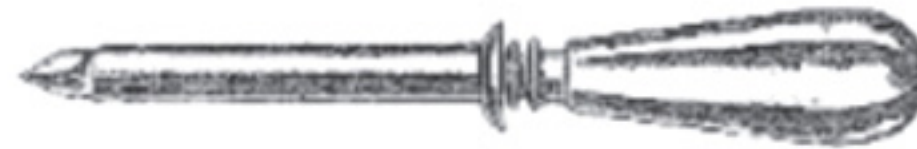
NELSON 5-150 25 Fg. 5-152 30 Fg. 5-154 33 Fg. 5-156 35 Fg.