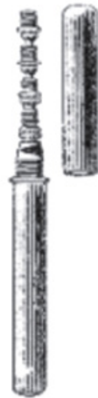
UNIVERSAL 5-100 SET OF 3