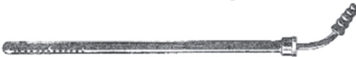
POOLE 5-240 30 Fg.