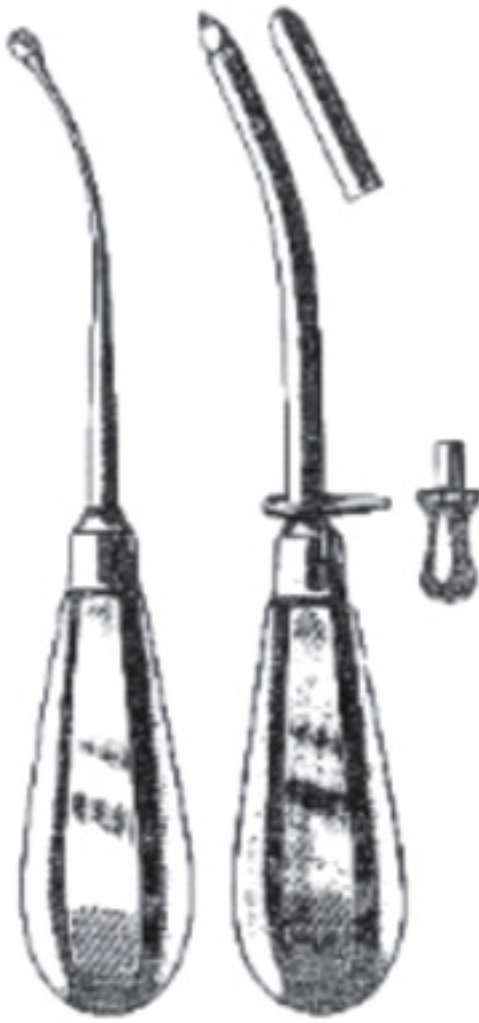
KRAUSE 5-200 5.5mm