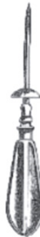
HYDROCELE 5-180 8Fg. 5-182 9fg. 5-184 10Fg.